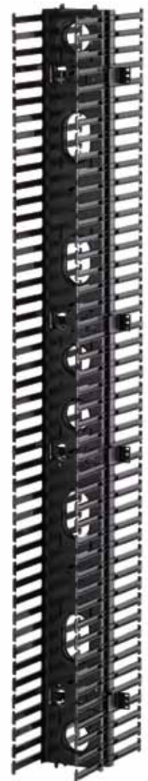
Front & Rear, 80"