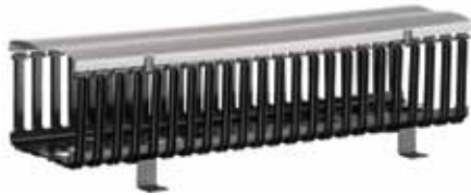
Front Only, 80" w/ designer cover (40" section shown) 8C80L-VFO