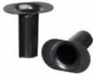
Slack Loop Organizer 89265-SL1