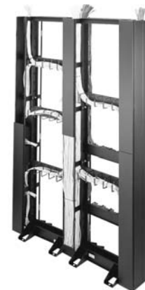
(2) RL10-45 shown with optional cable organizers and covers

OPEN FRAME RACK ACCESSORIES CANTILEVER SUPPORT BASE CENTER CABLE ORGANIZER END CABLE ORGANIZER CABLE ORGANIZER COVERS