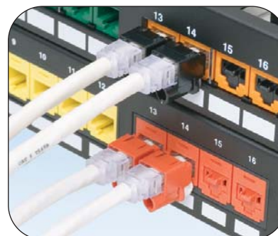
For flush mount applications