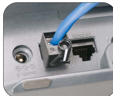
For recessed applications

It is recommended to test your specific patch cords and jacks before implementing widespread usage.