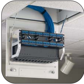
Zone Cable Boxes